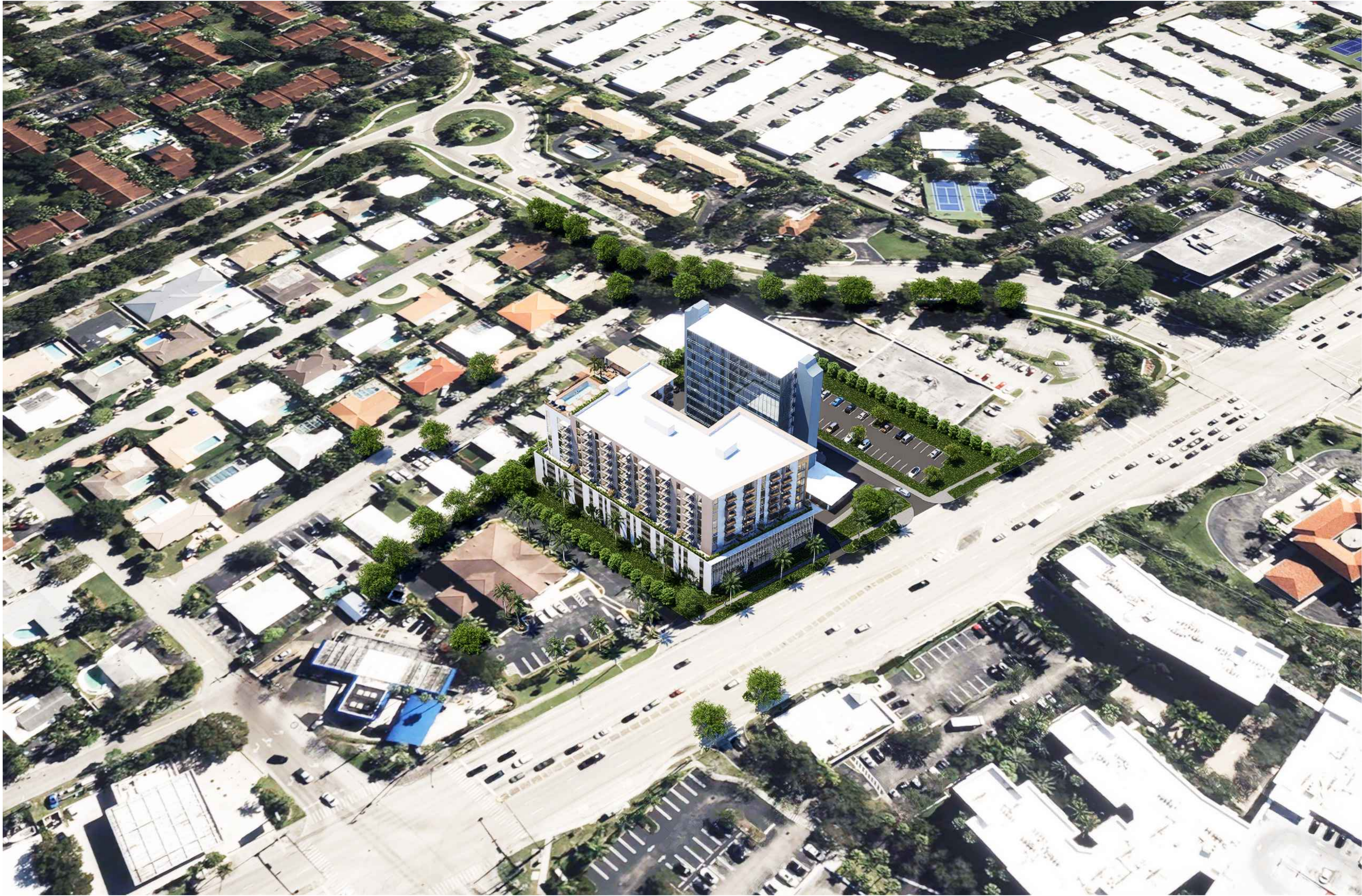
AREA VIEW LOOKING SOUTH EAST